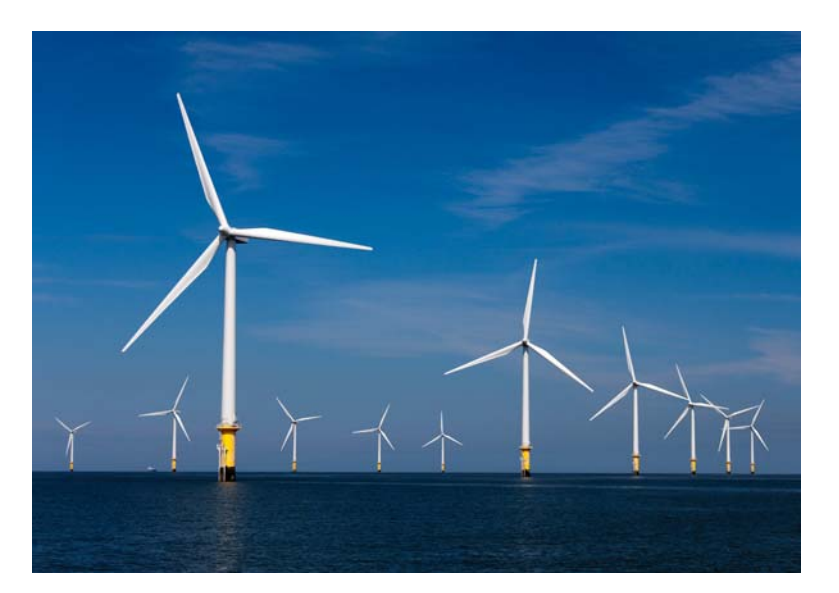
Seminar 3 - SOIL STRUCTURE INTERACTION UNDER DYNAMIC LOADING CONDITIONS